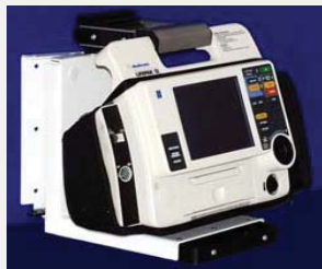
LIFEPAK 12 Seated in Swivel Mount

During installation, you can convert right-hinged swivel wall mount into a left-hinged swivel wall mount.