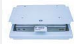
HeartStart MRx EMS Holder