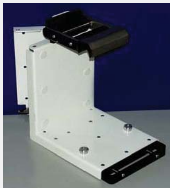
LIFEPAK 12/15 Right-Hinged Swivel Wall Mount