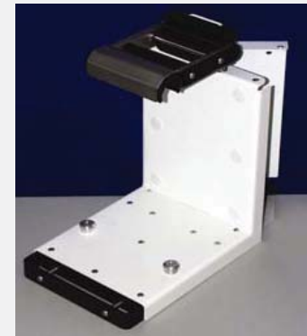
LIFEPAK 12/15 Left-Hinged Swivel Wall Mount

During installation, you can convert right-hinged swivel wall mount into a left-hinged swivel wall mount.