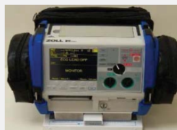
E Series on Mount