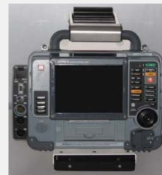
LIFEPAK 15 Seated in Universal Mount

Height is 20" when fully opened. We recommend at least 20" of vertical height to mount on shelf, and 22" to mount on wall. Width is 15.25" including device. 18.25" if using the carry case with 2 side pouches.