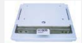
M Series Mount with Xtreme Pack II and NIBP