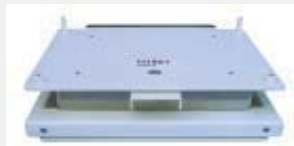
M Series Mount without Xtreme Pack II