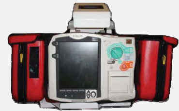
HeartStart MRx EMS Holder with Red Bag