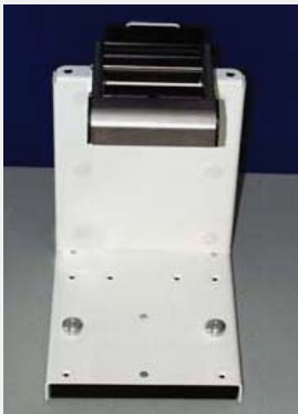
LIFEPAK 12/15 Universal Mount