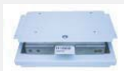
M Series Mount with Xtreme Pack II